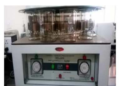
Automatic Tissue Processor