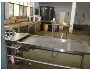
Necropsy table in Postmortem hall